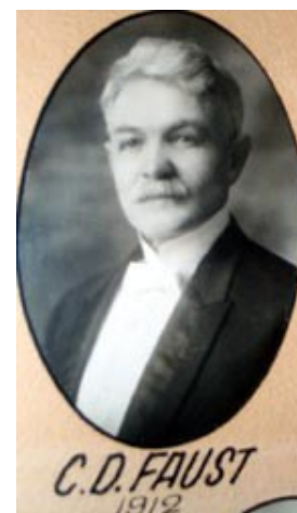
House Painter Watchmaker/Jeweler